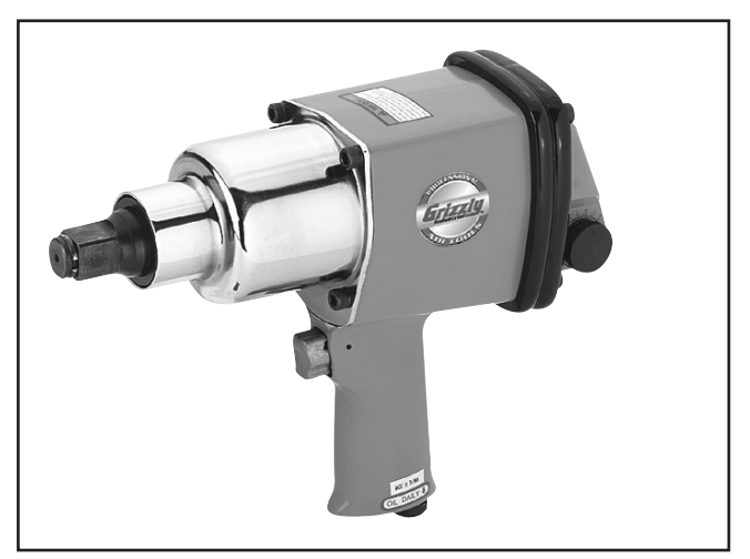
Figure 1. Model H0581.

Install any \frac{3}{4} " drive socket onto your impact wrench. Choose from clockwise (R) to tighten, or counterclockwise (L) to loosen by pushing the direction valve ( Ref # 47 ) in or out. Adjust the torque with the direction valve knob. One (1) is the highest setting, six (6) is the lowest.